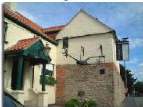
Royal Oak, Long Whatton