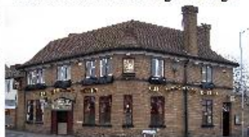
Kings Arms, Colcorton